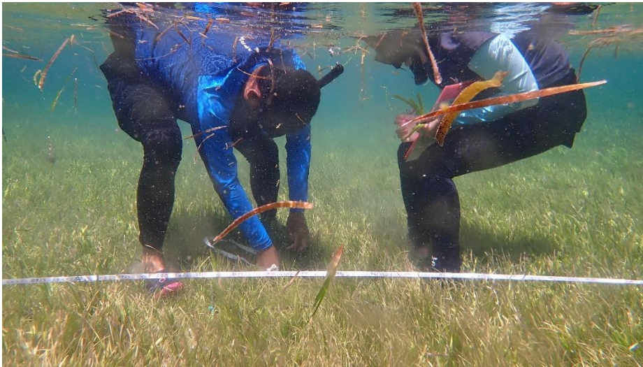
Photo: Seagrass monitoring training with students from The Maldives National University