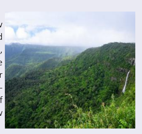
Tron aux Cerfs Crater & Viewpoint

The first national park of Mauritius was established with the view to preserve the last remaining endemic forest of the island. Inaugurated and opened to visitors in the 1990's, it includes the Macchabée forest, Combo and Bel Ombre's natural reserves. Still standing there is the rare ebony tree, sought for and plundered by constructors of seafaring war crafts as the hardest wood available, during the expansion era of maritime navigation. The park also offers several hiking and trekking tracks of different distance and difficulty level, which can be covered in a few hours.